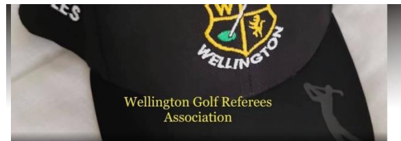
WGRA - Wellington Golf Referees Association

Just a reminder of a new Rules resource, the WGRA Facebook page. It's a private group but easy to find. Simply apply for access. It's for the